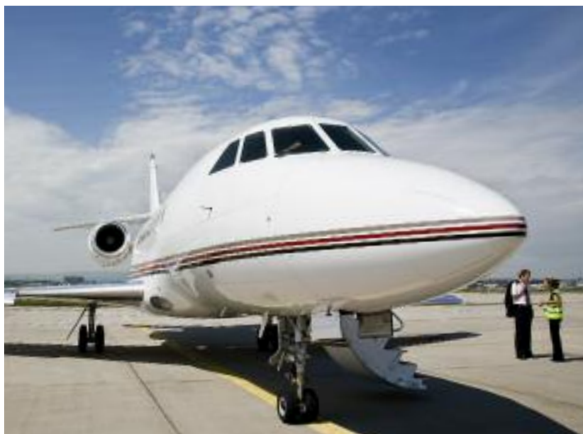
UNDER THE TUSCAN SUN: (Clockwise from top left) Balloons aloft at dawn; the converted blue-jeans mogul discusses his new line of work; a savory dish raised on the neighboring hills; private aircraft beat commuter planes every time; touching up the villa; a bottle of Marco Bacci's Chianti Classico